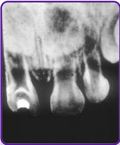
Figure BG1 Shows dense new dentin bridge and incompletely formed roots one month following pulpotomy on primary right central incisor.