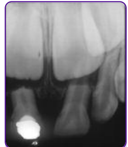
Figure BG3 Shows normal resorption of the roots of the pulp-tomized tooth.

the remaining pulp tissue. Zinc phosphate cement was used to seal the dressing in place and provide a supportive base for a self-curing resin restoration. Baby Gilbert showed no evidence of discomfort following the pulpotomy.