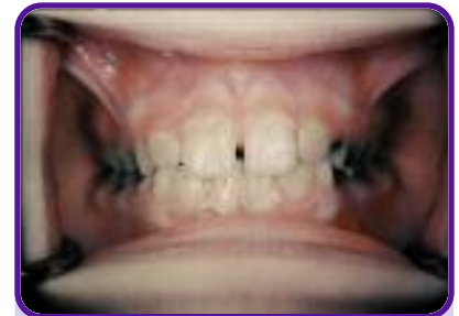
Figure BG5 Shows normally erupted permanent teeth with no defects.

cular component with many dilated vessels and perivascular infiltrations of leukocytes and plasma cells. The number of odontoblasts was reduced and one pulpal horn appeared to have a small intrapulpal abscess. The apex of the tooth demonstrated normal physiological resorption.