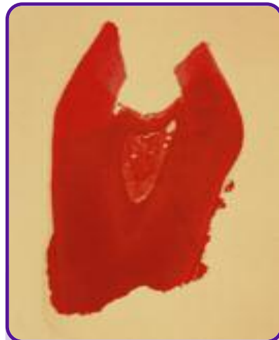
Figure BG4 Histological section shows dentin bridge and resorption of the root.

Histological examination revealed a vital pulp completely enclosed in dentin, although containing several foci of inflammation ( BG4 ). At the initial site of amputation a new dentin bridge had formed, re-enclosing the pulp in its own natural, protective chamber. The pulp tissue exhibited a prominent vas-