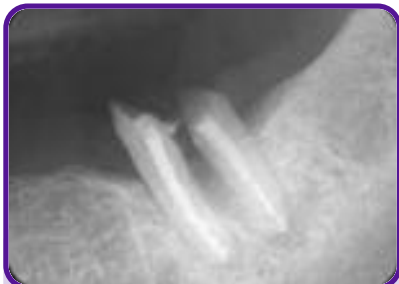
Figure HL4 Radiograph shows root canals filled with Pulpdent Root Canal Sealer and total healing of the periapical lesions.