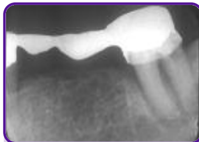
Figure HL2 Radiograph shows copper band attached to the crown and canals filled with Pulpdent TempCanal.