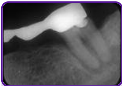
Figure HL1 Note carious lesion on the distal of the molar.