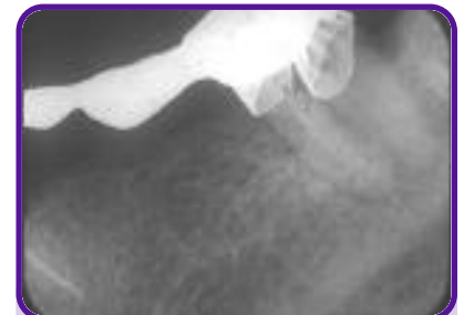
Figure HL3 Radiograph shows copper bands attached to the existing crown. Note periapical healing.