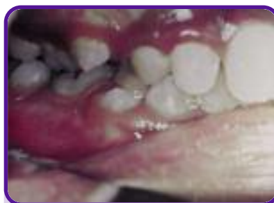
Figure PRAD2 Shows parulis healing without surgery.