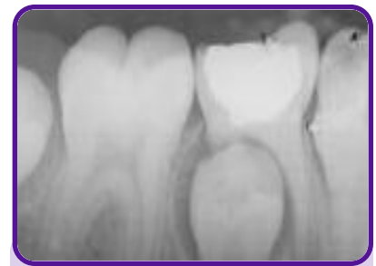
Figure PRAD3 Shows erupting second bicuspid.

Dr. Pradhan further reported to me that none of these twenty-three cases required anesthesia.